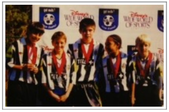
Rebellion US National Champion Runner-up 2003